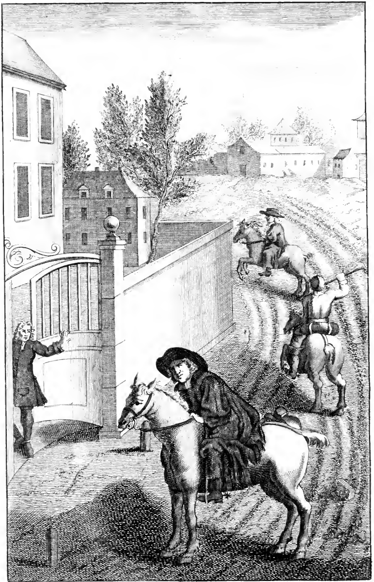
In State Opinione Alameda.